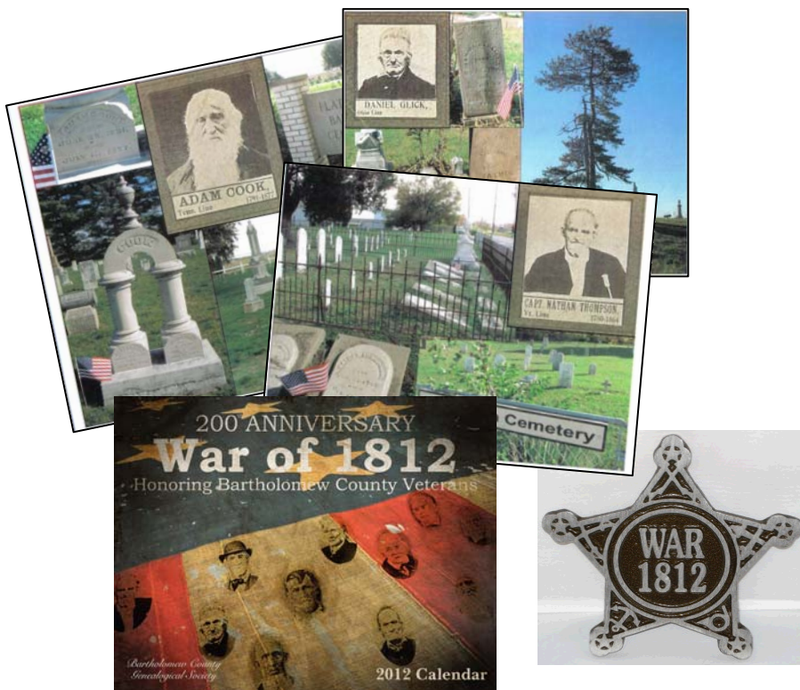
War of 1812 BCGS Veterans Calendar